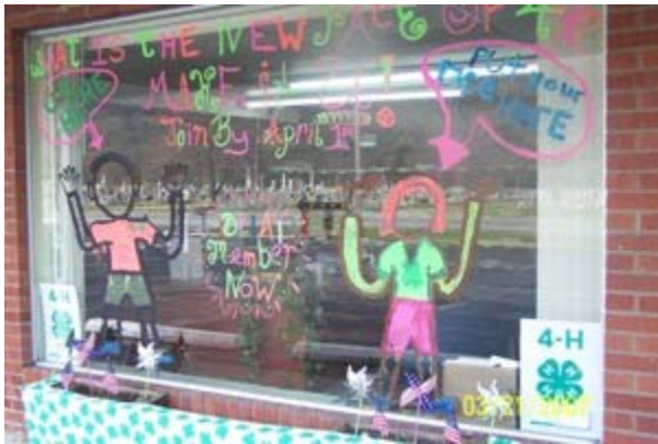
Window Painting Display at our office.