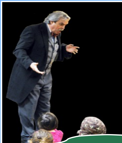
Kick-off Celebration at the Aurora Public Library on June 4, 2011 at 11 a.m.

Ronald McDonald will be at the Dillsboro Public Library on July 21st at 2 p.m.